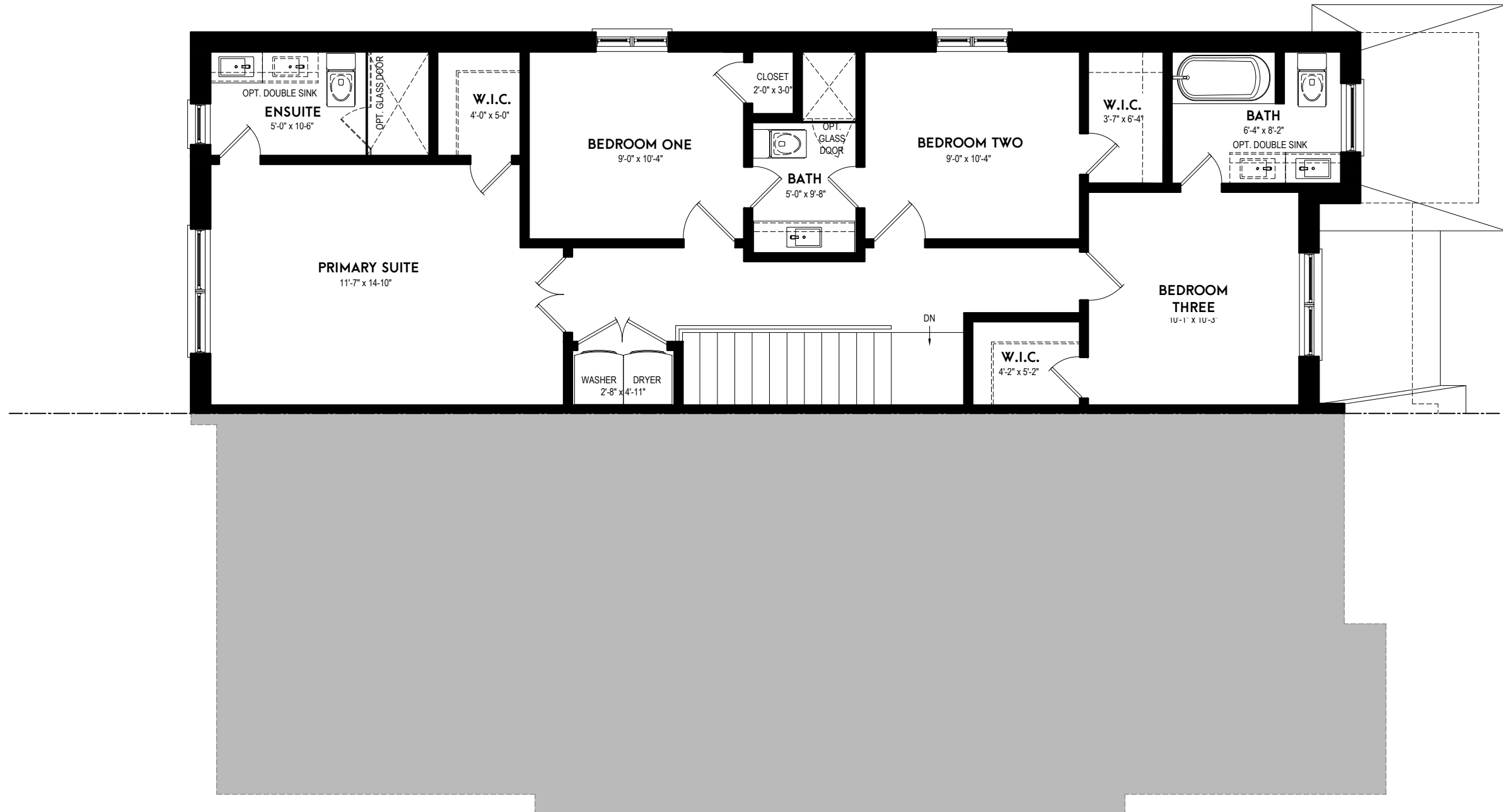
1/4"=1'-0" SECOND FLOOR PLAN 1001.90 SQ.FT